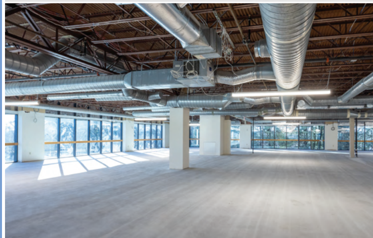
VERSATILE SPACE FOR MEDICAL USERS