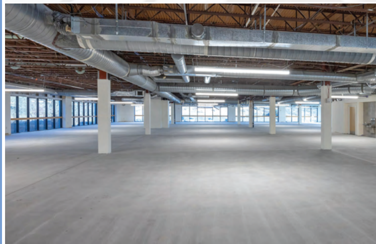
FULL FLOOR AVAILABILITY