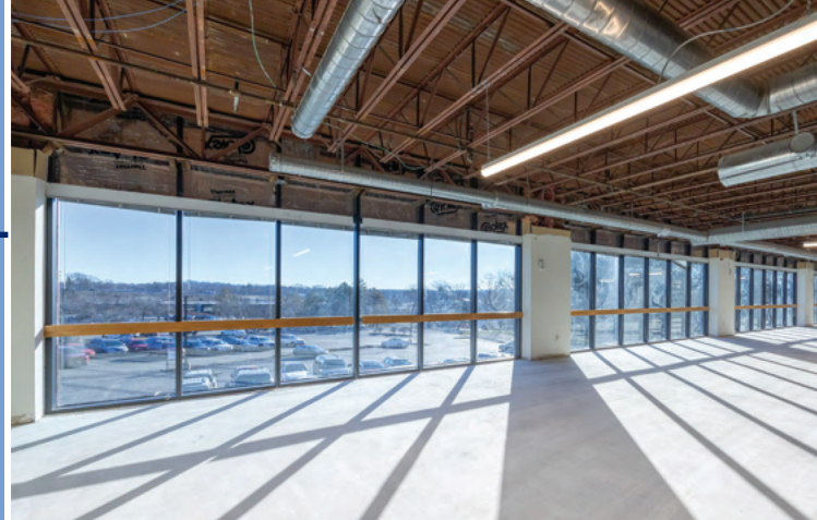
EXPANSIVE WINDOW LINE

SECOND FLOOR | ±4,200 - 33,000 SF AVAILABLE